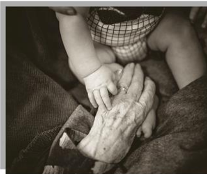
Sponsored by the Diocese of Savannah and the Knights of Columbus, Council 631