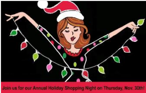
Join us for our Annual Holiday Shopping Night on Thursday, Nov. 30th.